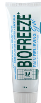
Biofreeze Pain Relieving Gel 110g

Always read the label. Follow the directions for use. If symptoms persist, talk to your health professional.