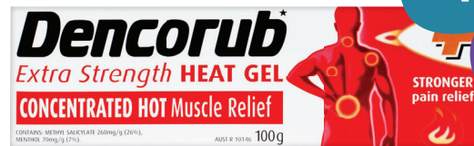
Dencorub Extra Strength Heat Gel 100g

This medicine may not be right for you. Read the label before purchase. Follow the directions for use. If symptoms persist, talk to your health professional.