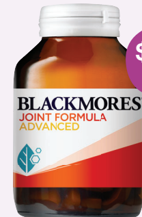
Blackmores Joint Formula Advanced 120 Tablets

Always read the label. Follow the directions for use.