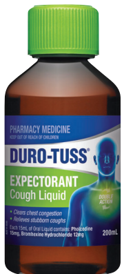
Duro-Tuss Expectorant Cough Liquid 200mL

This medicine may not be right for you. Read the label before purchase. Follow the directions for use. If symptoms worsen or change unexpectedly, talk to your health professional.