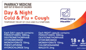
Pharmacy Health Day & Night Cold & Flu + Cough 24 Capsules

This medicine may not be right for you. Read the label before purchase. Follow the directions for use. If symptoms persist, talk to your health professional.