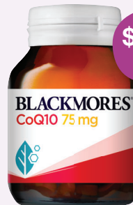
Blackmores CoQ10 75mg 90 Capsules