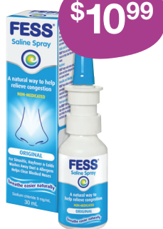
Fess Saline Spray 30mL

This medicine may not be right for you. Read the label before purchase. Follow the directions for use. If symptoms persist, talk to your health professional.