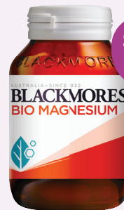
Blackmores Bio Magnesium 100 Tablets