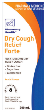
Pharmacy Health Dry Cough Relief Forte 200mL

This medicine may not be right for you. Read the label before purchase. Follow the directions for use. If symptoms worsen or change unexpectedly, talk to your health professional.