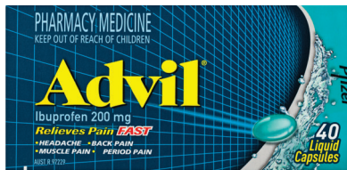
Advil 40 Liquid Capsules

This medicine may not be right for you. Read the label before purchase. Follow the directions for use. If symptoms persist, talk to your health professional. Incorrect use could be harmful.