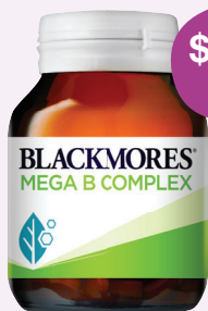
Blackmores Mega B Complex 75 Tablets