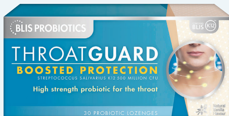
Blis Probiotics ThroatGuard Boosted Protection 30 Lozenges

This medicine may not be right for you. Read the label before purchase. Follow the directions for use. If symptoms worsen or change unexpectedly, talk to your health professional.