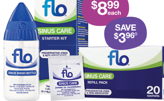
Flo Sinus Care Starter Kit or Refill Pack 20 Sachets

Always read the label. Follow the directions for use. If symptoms persist, talk to your health professional.