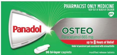
Panadol Osteo 96 Caplets

Ask your pharmacist – they must decide if this product is right for you.