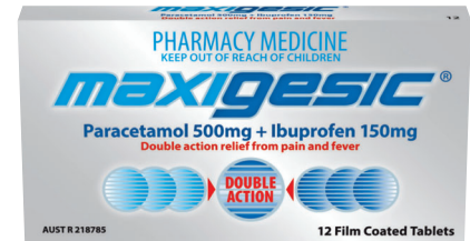
Maxigesic 12 Tablets

From 1st June, Panadol Osteo will only be available from the dispensary area. Speak to our Pharmacist to see how we can assist you. This item does not require a prescription.