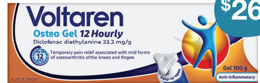
Voltaren Osteo Gel 12 Hourly 100g

Always read the label. Follow the directions for use. If symptoms persist, talk to your health professional.