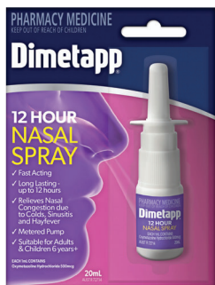
Dimetapp 12 Hour Nasal Spray 20mL

This medicine may not be right for you. Read the label before purchase. Follow the directions for use. If symptoms worsen or change unexpectedly, talk to your health professional.