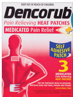
Dencorub Pain Relieving Heat Patches 3 Patches

This medicine may not be right for you. Read the label before purchase. Follow the directions for use. If symptoms persist, talk to your health professional.