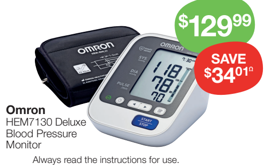
Follow the instructions for use.