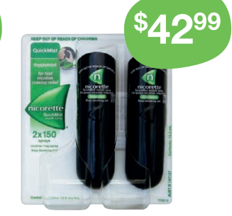
Nicorette QuickMist 2 x 150 Sprays range Always read the label. Follow the directions for use.