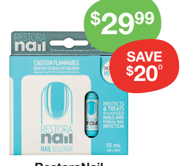
RestoraNail Nail Solution 15mL Always read the instructions for use. Follow the instructions for use.

unexpectedly, talk to your health professional.