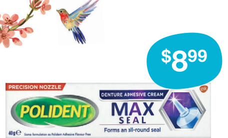
Polident Max Seal 40g