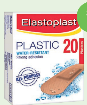
Elastoplast Plastic Plasters 20 Plasters