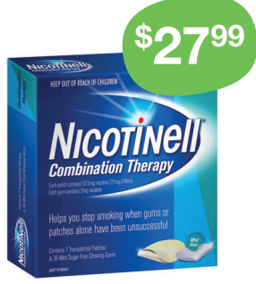
Nicotinell Combination Therapy 7 Patches & 36 Mint Chewing Gums