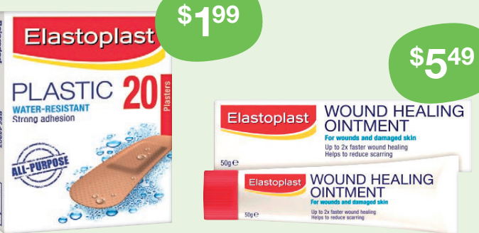
Elastoplast Wound Healing Ointment 50g