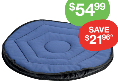
Making Life Easy Cushion Swivel