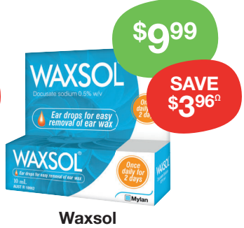
Ear Drops 10mL Always read the label. Follow the directions for use. If symptoms persist, worsen or change

unexpectedly, talk to your health professional.